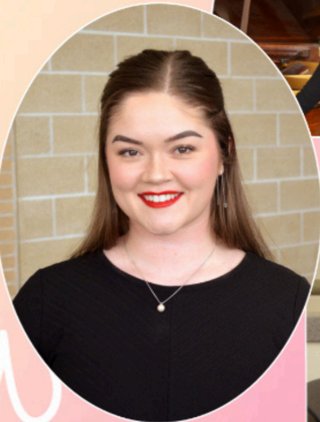
Lorelei Dowland, mezzo-soprano