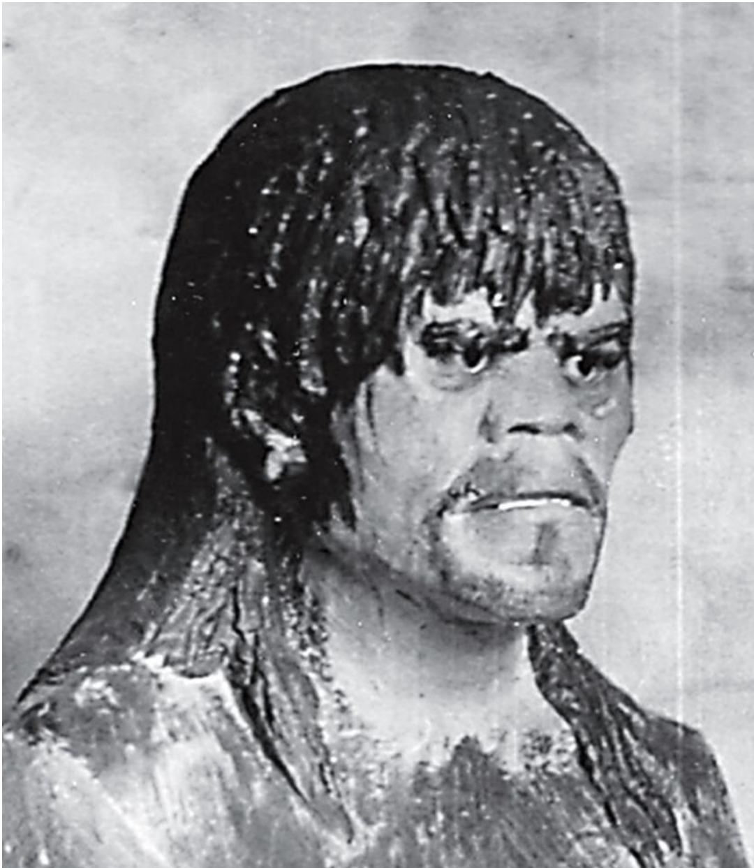
Figure 8. Detail of Professor W. Plawinskiy's reconstruction of the almas .