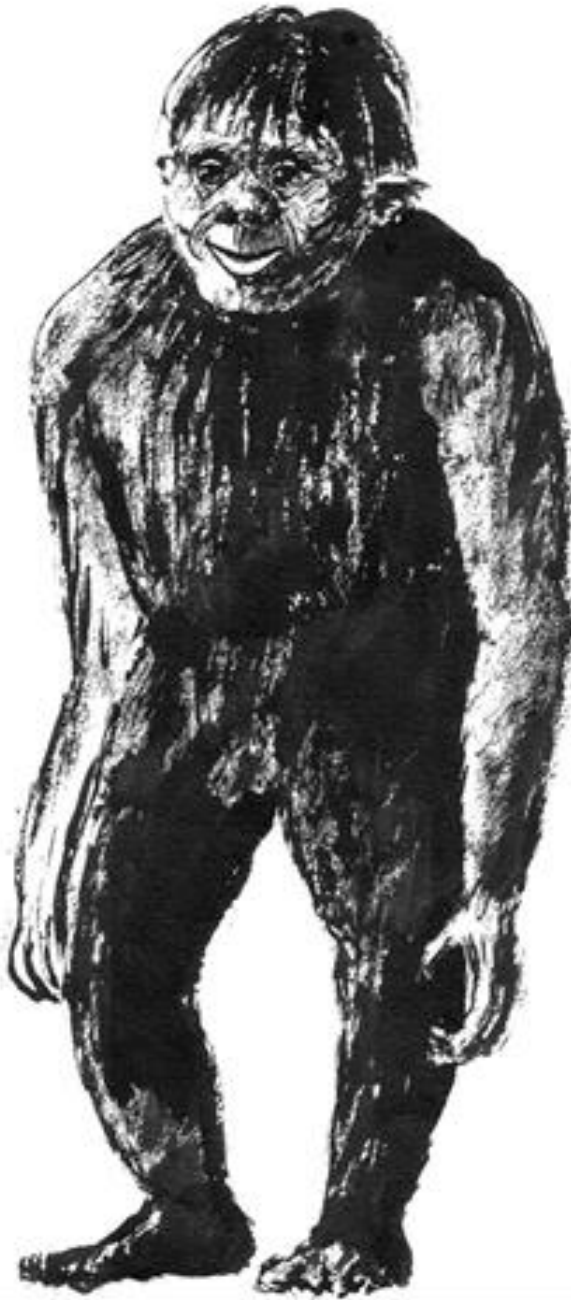
Figure 3. Appearance of the almas based on eyewitness description.