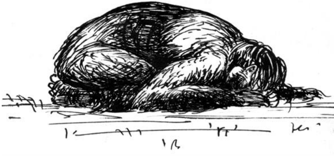
Figure 2. The sleeping posture of the almas , as described by eyewitness.