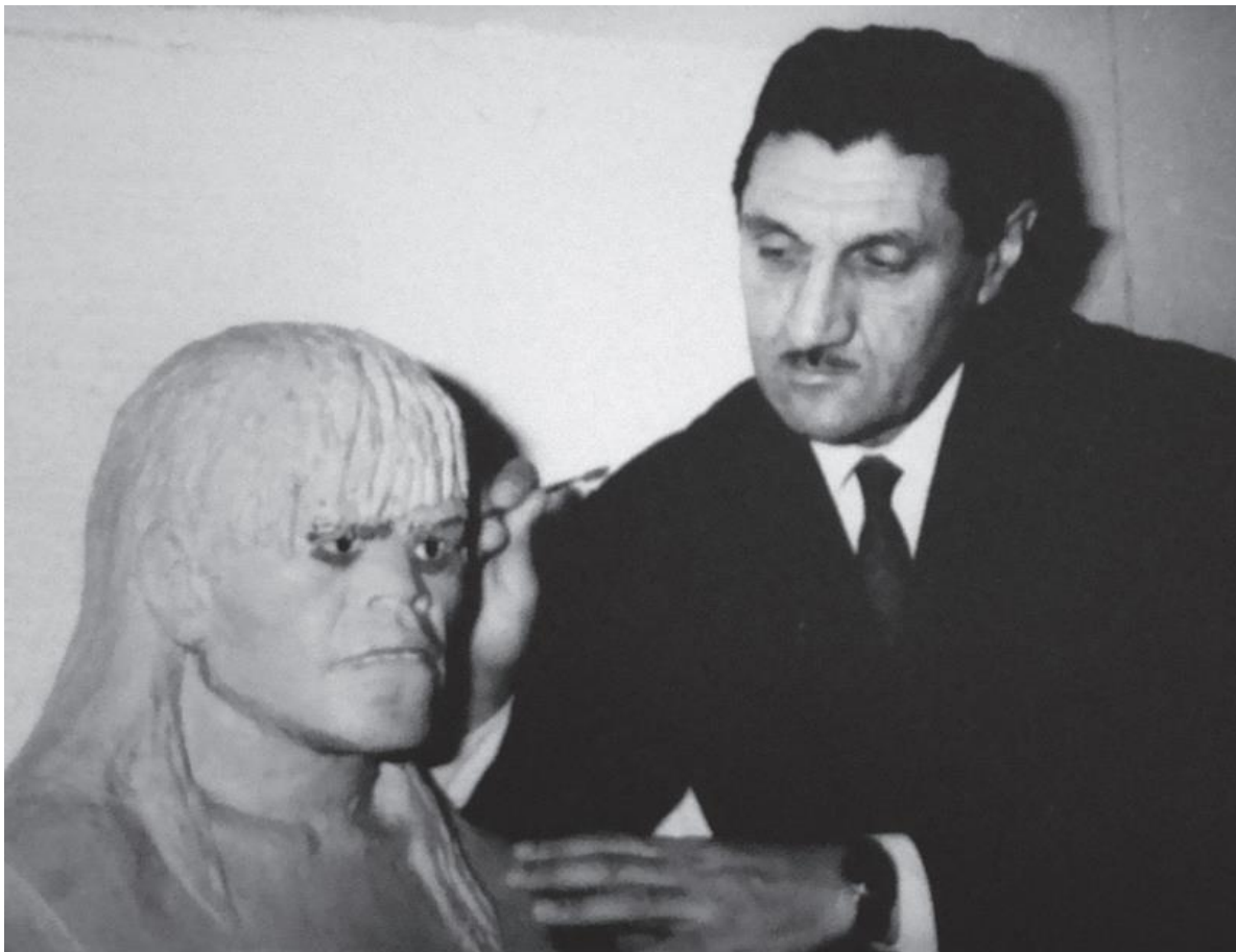
Figure 7. Professor Wencislaw Plawinski (Poland) with his reconstruction of the almas .