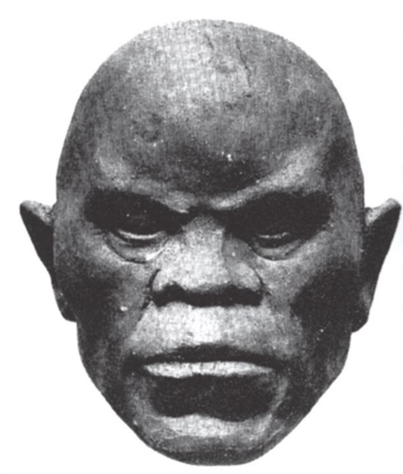
Figure 6. Forensic reconstruction of the face of the almas (by Wenzcislaw Plawinskiy).