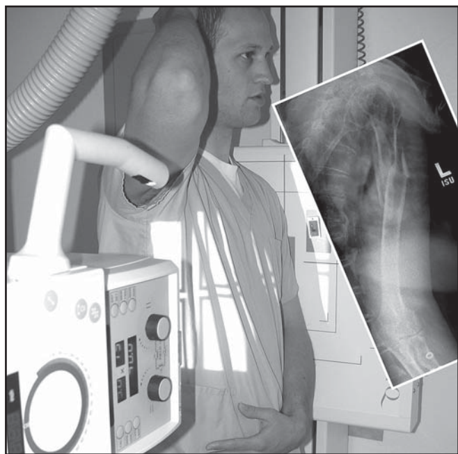
Figure 3. Standing transthoracic/transabdominal projection of the humerus and resulting radiograph. The patient is positioned laterally with the unaffected arm raised above the head. This position is 90° from the AP projection and can be performed sitting or recumbent.

or erect. The disadvantage is that both projections are reserved for ambulatory patients because the humerus must be internally and externally rotated to obtain the desired results.