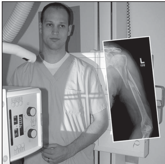
Figure 2. Standing AP projection with a slight 20° to 25° left posterior oblique position and resulting radiograph. This position can be performed either sitting or standing, as demonstrated here.